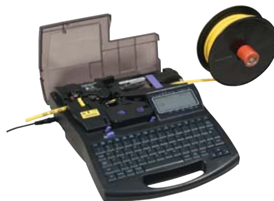
PLIOSCRIB M1-Pro 0378 0501 000