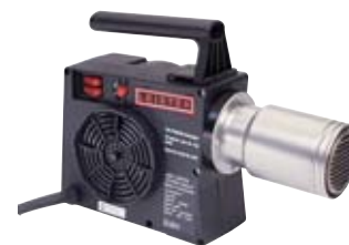
SES-Leister Hotwind S 0594 0050 000