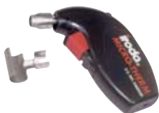
IRODA Piezo electronic self-starting ignition system 0533 0120 000

If you need more details, please see section TOOLS in Group D7 of this catalogue.