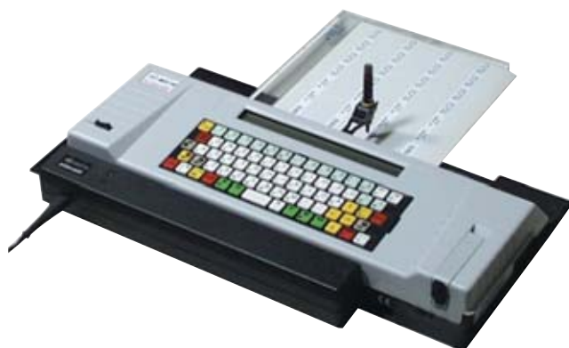
PLIOSCRIB MX-10 0378 0101 000

Printer for identifying a large range of our heat shrinkable sleeveings: